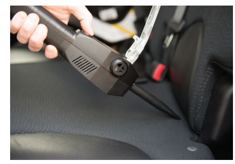
Optional Vapor Sampler