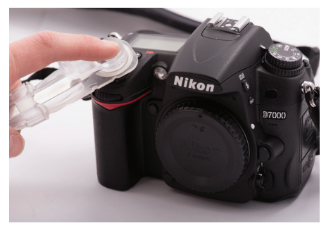
Sampling Electronic Items